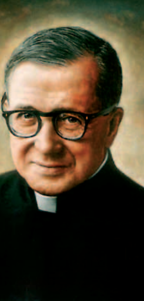
■ St Josemaria Escriva

In situations that appeared entirely hopeless from a human point of view, the saint frequently relied on angelic intervention and encouraged everyone to do the same.